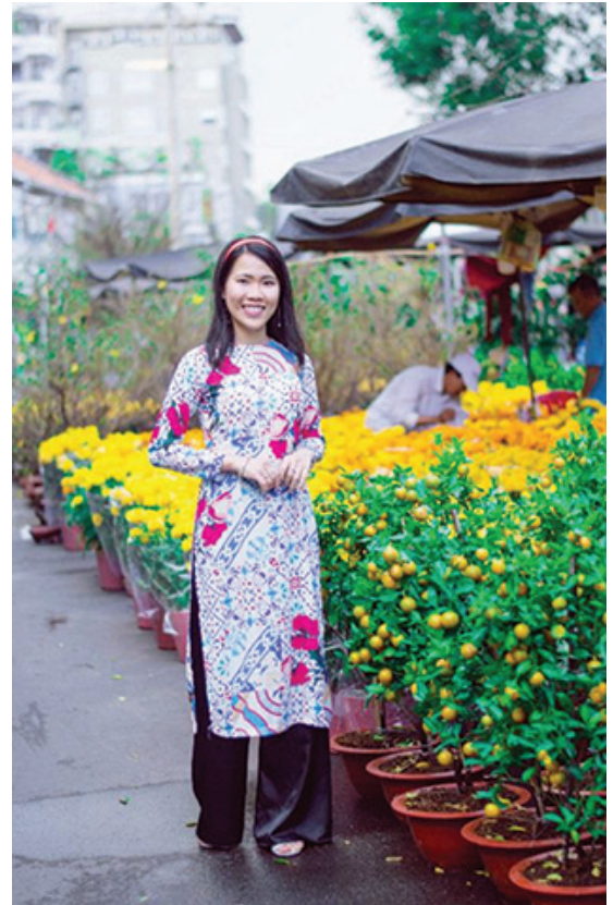
Figure 7 Ninh Kieu Quay Market 9