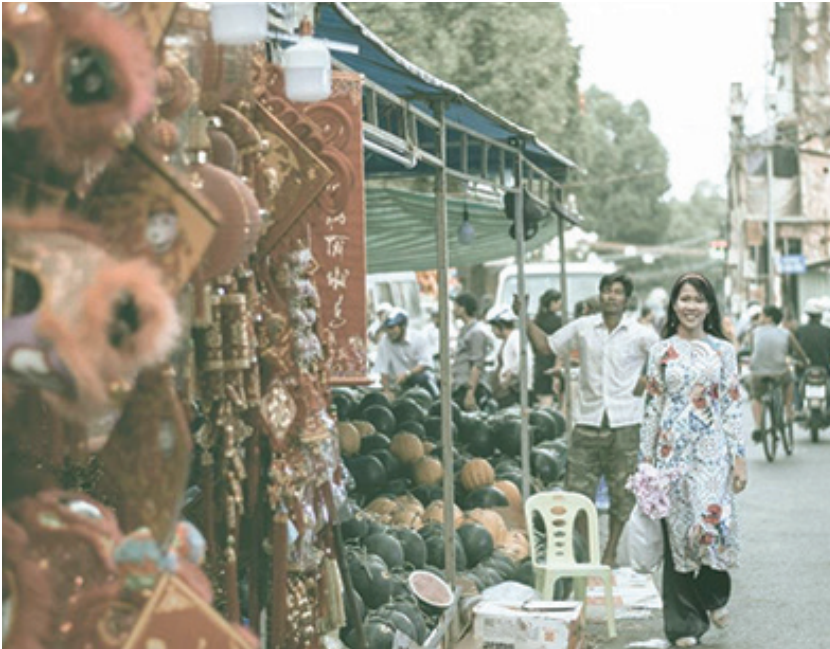
Figure 6 Ninh Kieu Quay Market 9