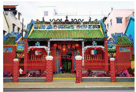
Figure 1 The Ong Pagoda 2

The Ong Pagoda is the oldest pagoda in Can Tho city. Here, the community pray to Guan Gong or