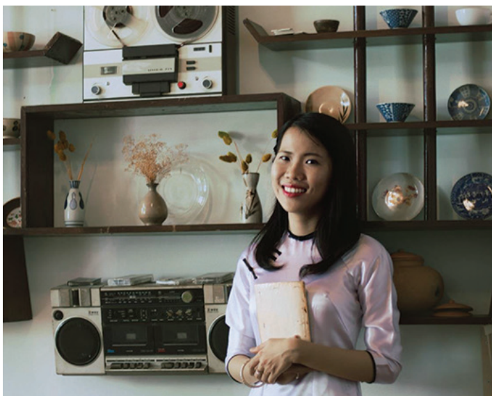
Figure 4 Cafe Ut Hieu 5

Since Can Tho city is a famous place for its floating market, thus, our next stop is Ninh Kieu Quay.