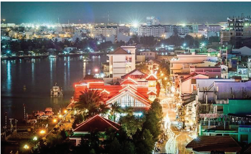
Figure 8 The place reaches its peak time in the evening, where visitors spend their time sightseeing, or just strolling to admire the park's lighting system 10