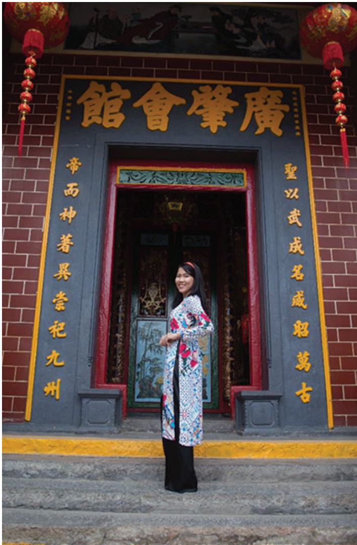
Figure 2 The Ong Pagoda entrance 3