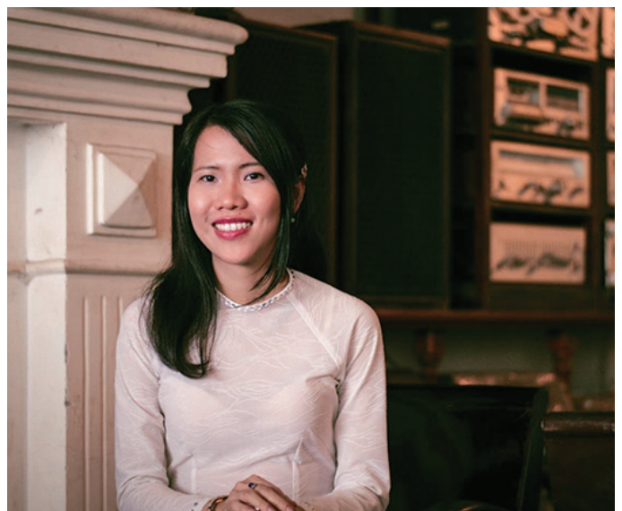
Figure 5 Cafe Am Thanh Xua 6