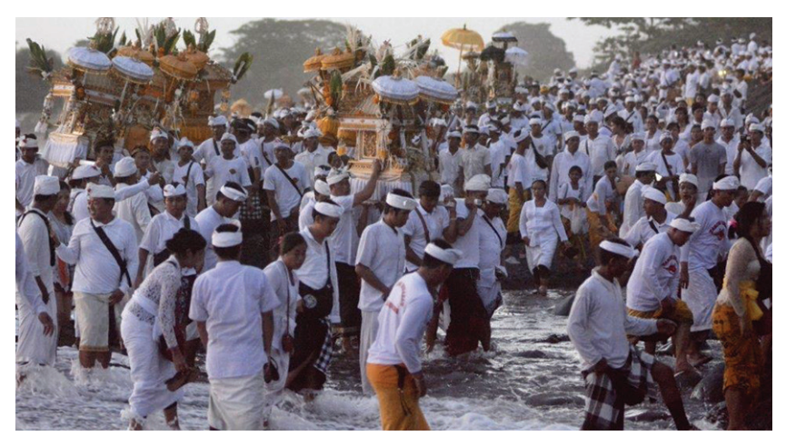
Figure 3. At Watu Klotok Beach<sup>8</sup>

After the Melasti procession at Watu Klotok, the entourage proceeded to Penataran Agung Klungkung Temple on Semeru Street, Semarapura. The party stayed overnight and continued the travel on the next day, on Sunday 03 February 2019. On the second day, the convoy visited several temples and villages: Puseh Temple in Tohjiwa Village, Paksebali Village, Lebu Village, and then the entourage stayed for overnight at Puseh Tebola Temple in Sidemen Village, the procession then continued on Monday (03/04/2019). When the convoy returned at the Besakih Temple, the community then placed the relics on the altar. The procession was halted for three days due to preparation for Nyepi Day. The series of the ceremony lasted for a month and seven days, from January 22nd until April 12th, 2019.9