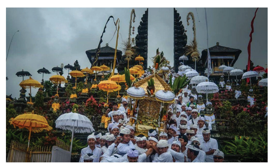
Figure. 1 After the prayer finished, the entourage began their travel, led by The Relics of Ida Bhatara Catur Lawa, consist of four deities Ida Bhatara Ratu Bagus Pande, Ratu Pasek, Ratu Bagus Penyarikan, and Ratu Dukuh Segening followed by other Relics.<sup>6</sup>