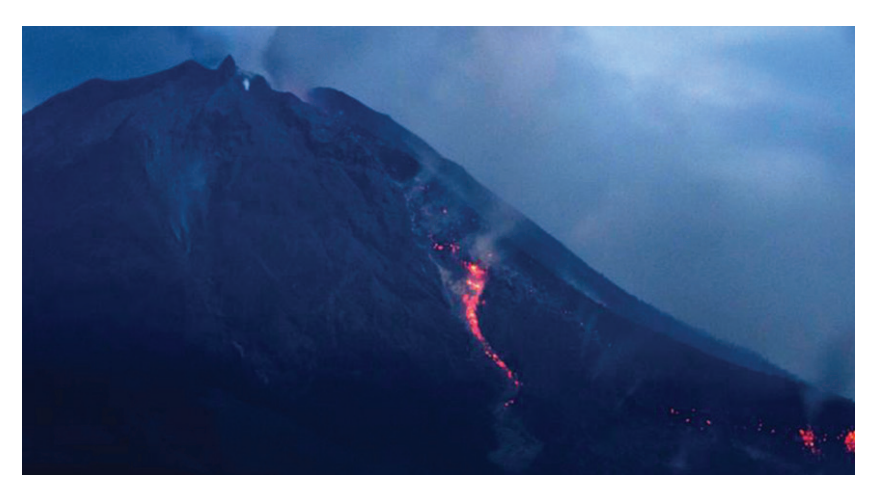
Figure 4. Mount Agung erupted On Saturday 9 March at 12.47 pm Bali local time. The Mountain watcher reported the eruption on Friday (3/15) occurred at 18:27. The ash column height around 1,000 meters above the peak, with eruption duration about 1 minute 23 seconds. <sup>10</sup>

communities who visited Besakih Temple, for pray or doing their service were still allowed to do their activity within the temple area.<sup>11</sup>