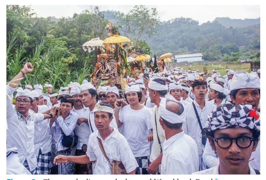
Figure 2. The sacred relics marched toward Watu klotok Beach<sup>7</sup>