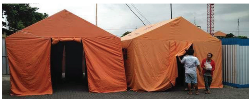
Figure 5 Figure 6

In 2019, a grand Yadnya ceremony, Panca Wali Krama was held two times in Lempuyang Luhur Temple and Besakih Temple. Hindu communities from all regions in Bali came to participate in the event, as their symbol of faith toward the God Almighty. This ten-year event took place for more than twenty days in Lempuyang Luhur and thirty-seven days in Besakih temple. While Panca Wali Krama was taking place at Besakih, Mount Agung has been reported experiencing several hiccups on 9, 15 and 21 March 2019. Despite the eruption, the communities kept doing their prayer and service