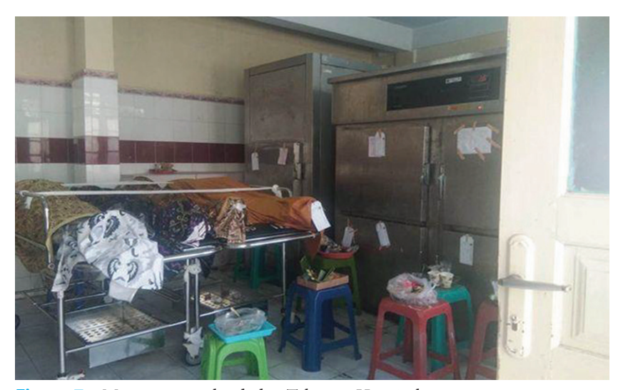
Figure 7. Mortuary overloaded at Tabanan Hospital

at the temple located on the slope of the volcano. Meanwhile, another crisis was faced by hospitals on the island, due to an announcement from the official to ban Ngaben ceremony until the Yadnya is over. As a result, Mortuary in several hospitals was reported overloaded. The official and Government hastily response to the overloaded problem, since according to Balinese Hindu believe, keeping the dead body stranded was considered defiling the area.