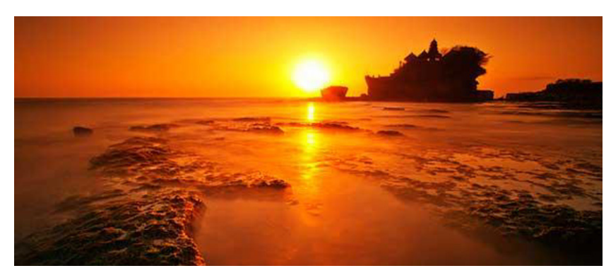
Figure 3. Iconic Sunset of Tanah lot<sup>5</sup>