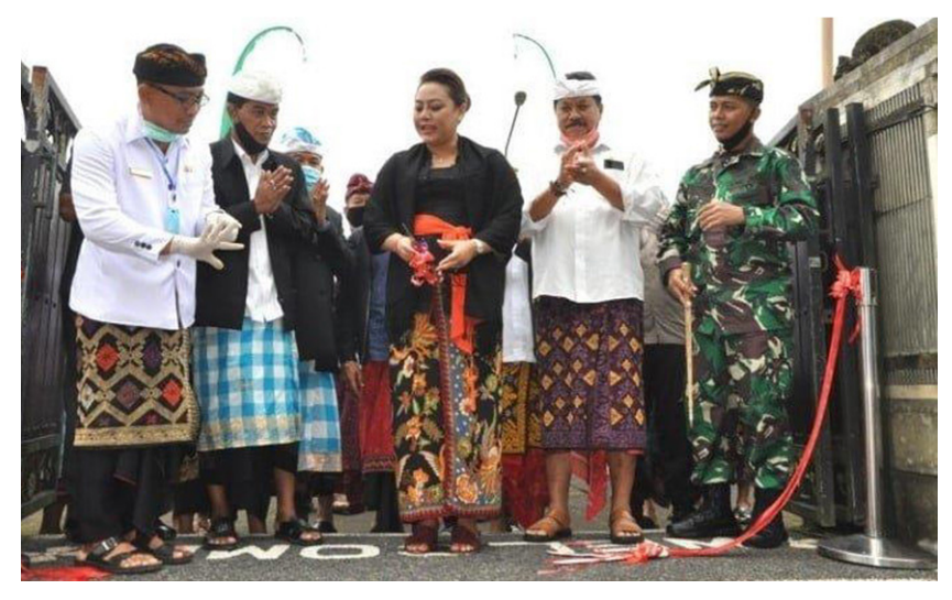
Figure 4. Tabanan Regent, Eka Wiryastuti (middle) when reopened five tourism objects in Tabanan regency, including Tanah Lot.<sup>10</sup>

snakes are protected by some 'pecalang' to ensure the visitor's safety and protect the serpent from irresponsible tourists. Despite its friendly nature, it is compulsory to keep hands out from the animal unless the officer allows them to do so.