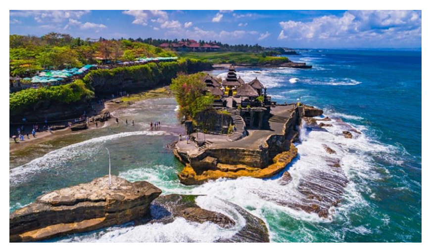
Figure 2. Aerial view of Tanah Lot<sup>4</sup>

superiority and willingness to accept him in the village.