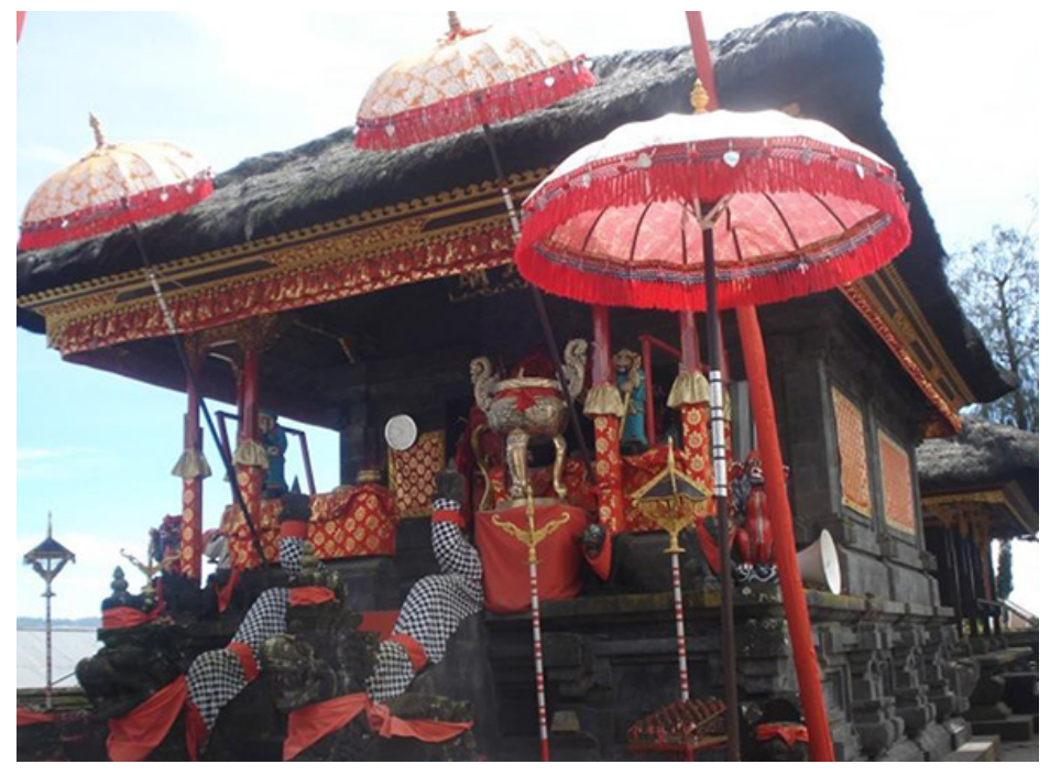
Figure 4. The Shrine of Ratu Ayu Mas Subandar. 12