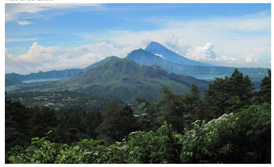
Figure 1. Mount Panarajon (Penulisan). The Chinese traders continued their exploration of Kintamani's southern part and reached the magnificent kingdom of Bali Dwipa on Mount Panarajon (Penulisan Mountain).<sup>4</sup>

Previously, the temple of Dalem Balingkang was a palace for King Sri Haji Jaya Pangus. Purana Dalem Balingkang , the temple's historical record, mentioned around the year 1053 Isaka/1131 AD, the king who occupied the royal throne in Bali