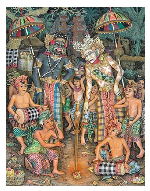
Figure 2. Artwork of Barong Landung.<sup>10</sup>

Remembering the word of the gods, he continued his journey down the hill of Panarajon accompanied by his two consorts to Dharma Anyar, a place of hermitage for saints, either Mpu, Maha Rsi, or others. When he arrived at Dharma