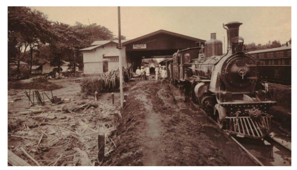
Figure 1. <sup>3</sup> 1864 – The first railway establishment in Java, Inaugurated by Dutch Governor-General Sloet van de Beele.