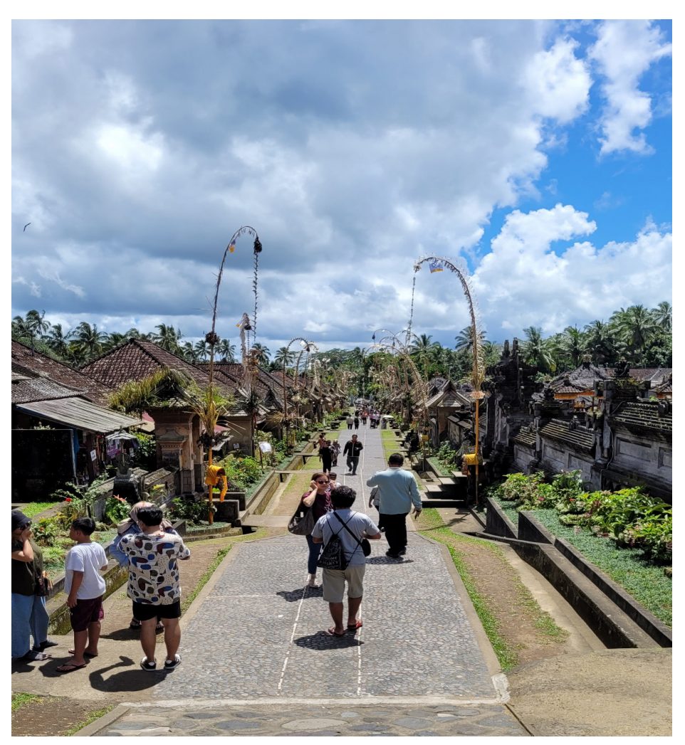
Figure 4. <sup>20</sup> Over the years, the festival implementation resulted in an exceptional outcome. The positive result was expected to impact the tourism industries and the Penglipuran indigenous village community.

exhibitions, Balinese dance competitions, performing arts, Megibung talk shows, yoga, and activity classes. For the main event, there were Ethnic & Pop Music performances named Penglipuran Night Ethnic Music. Two acknowledged ethnic musicians from Bali, Gus Teja World Music and Emoni Band stood as the event's lineup. Meanwhile, the Pop music performances featured Fourtwnty, Idgitaf, Iksan Scooter, Gede Robi, Tjok Bagus, The Byr's, and Rumah Cerita.<sup>18</sup>