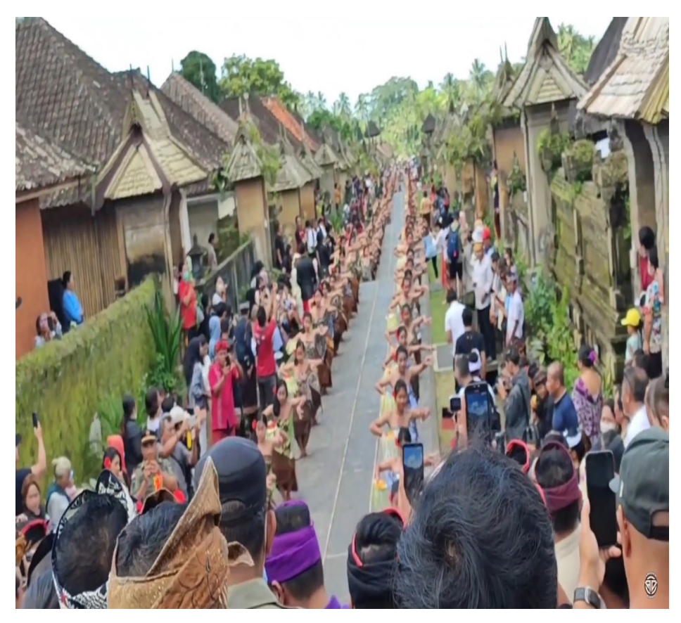
Figure 1. At least 200 junior high school students staged the Pendet Dance at the Penglipuran Village Festival IX, opening on Friday, 9 December 2022.

consisting of 76 as Krama Pengarep and the rest as Krama Pengerob. As a Krama Pengarep, they are responsible for planning the Yadnya ceremony at the temple and also do the service for the sake of the village's planning and physical development. Meanwhile, Krama Pengerob has fewer obligations compared to Krama Pangarep. Krama Pengerob is bound by duties and responsibilities similar to other custom society members of villages in Bangli. A customary law unit called Awig-awig became fundamental in managing the social life of Penglipuran society. Kelian Adat was the head and was assisted by two assistants, Penyarikan. One Penyarikan officer works physical urgency around the village, whereas Kancan Roras handles the spiritual-related matters with Jero Bayan as its chairman.8