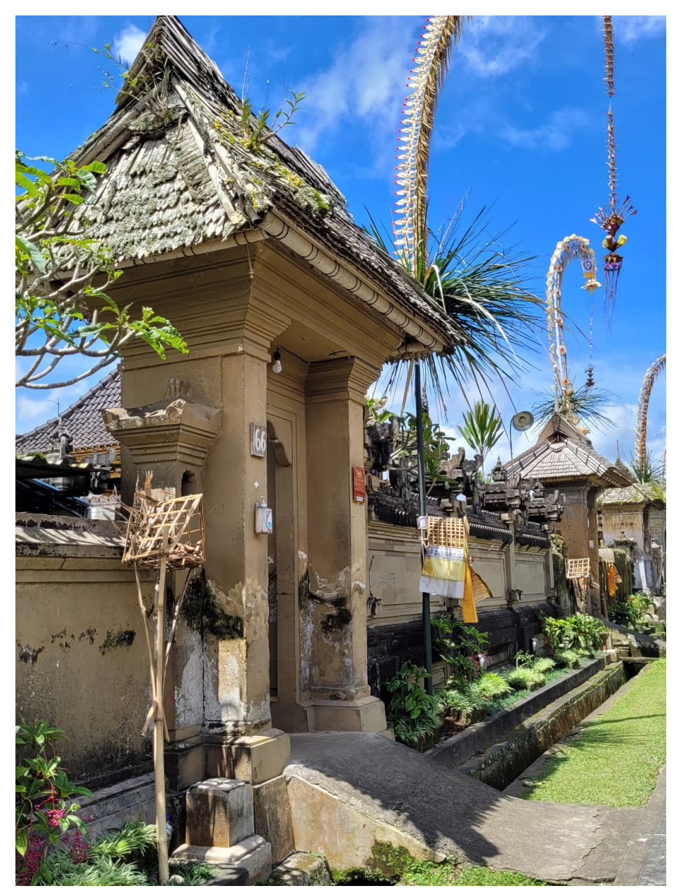
Figure 2. <sup>13</sup> Traditional gate architecture, Angkul-angkul, as the entrance to the resident's yard

dispose of the garbage. Furthermore, the village regulation prohibited motorized vehicles from entering the area. The law aims to reduce air pollution; therefore, the village's environment would remain fresh and serene.<sup>12</sup>