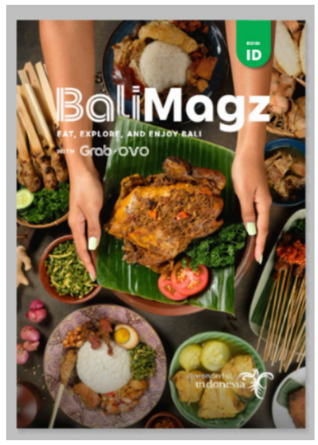
Figure 2. <sup>5</sup> Cover e-booklet Eksplorasi Pesona Pulau Dewata

two e-booklets provide travel guides for tourists using Indonesian. Consisting of 36 pages, this E-booklet encourages tourists to explore Balinese culinary delights, visit various tourist destinations, beach attractions, shopping tours, and easily access hotel accommodations. This guide conceptualizes travel with modes of transportation ordered online, both twowheeled and four-wheeled vehicles.6 The modes of transportation offered have also been transformed into environmentally friendly vehicles. In the following pages, these two guides recommend legendary Balinese culinary destinations, Asian cuisine, western dishes, and desserts, to restaurants with healthy dishes. Also, these two e-booklets offer places to buy souvenirs, beaches, attractions, the best spa locations, Instagram-able places, cultural, children-family tours, to the best bar clubs.