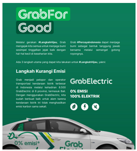
Figure 3. <sup>5</sup> E-booklet Bali Magz: Eat, Explore and Enjoy Bali, offers a green mode of transportation