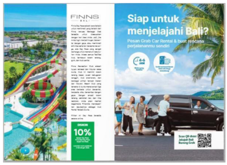
Figure 4. <sup>5</sup> E-booklet edisi Eksplorasi Pesona Pulau Dewata, promoting advantage of using online transportation

provided a clear picture and made it easier for tourists to arrange holiday concepts, schedules, hotel accommodations, travel routes, and clothes to wear while on vacation. However, suppose one reflect on the complete understanding of the booklet, in that case, the information elements regarding the prohibitions and regulations that apply in the province of Bali were not available in these two e-booklets.<sup>7,8,9</sup>