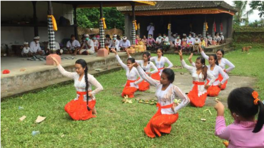
Figure 3. 12 This dance movement indicates the willingness of the dancer to surrender and purify oneself as the primary offering to God, allowing the great natural power to be internalized.

and the other fingers are brought together, forming a triangle. This movement is called Yoni mudrā, signifying the manifestation of divine power within the dancer, awakening self-preparedness to perform this dance as a form of the dancer's primary self-offering. Placing Yoni mudrā at the beginning of this movement is expected to invoke the power of God, in this case, as a manifestation of the divine force ( Pradana/Acetana ), indicating the dancer's readiness to perform. 10