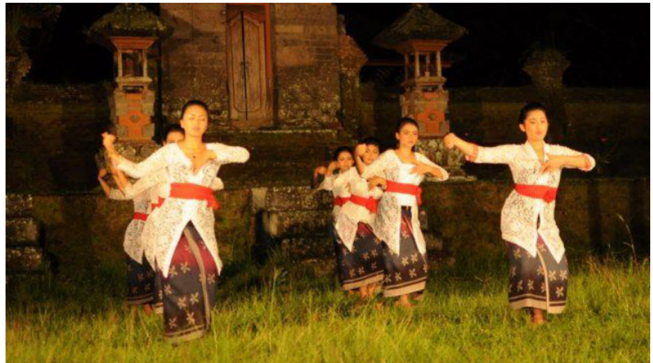
Figure 1. 6 The dance incorporates a distinctive movement called ngilud , where the hand's palm seems to grasp something and is moved from the inside to the outside.

Two intriguing elements distinguish Rejang Ilud from other Bali Rejang dances. The dance incorporates a distinctive movement called ngilud , where the hand's palm seems to grasp something and is moved from the inside to the outside. Typically, Rejang dances involve the ngayab movement, opening the palms in a specific direction. The ngayab movement is also present in Rejang Ilud. The ngilud movement can be associated with the "bodhyagiri mudrā," a hand gesture symbolizing the steadfastness of knowledge or consciousness. The ngilud movement can be interpreted as a symbol of concentrating the power of Ida Sang Hyang Widhi in bestowing blessings, symbolized by the ngayab movement known as "vara mudrā" (gesture of giving blessings) and presenting offerings. Another distinctive aspect is observed in the accompanying music ( tabuh ). While typical Balinese dances follow the rhythm of the percussion, Rejang Ilud operates in a contrasting manner. 4,5